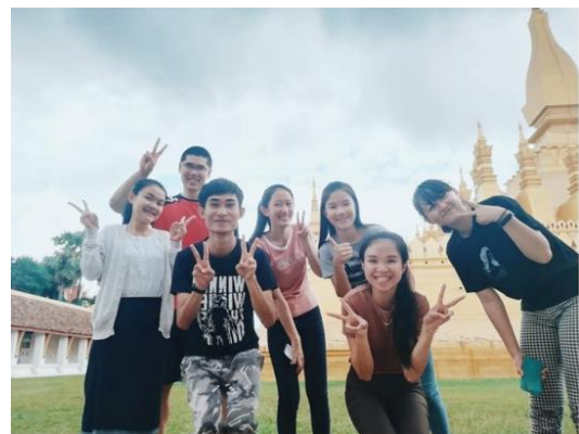
Students visited Patuxay and ThardLuang stupa.