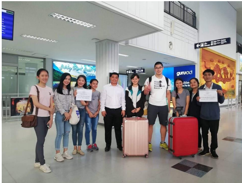
Two students from Japan arrived in Vientiane, Lao PDR.