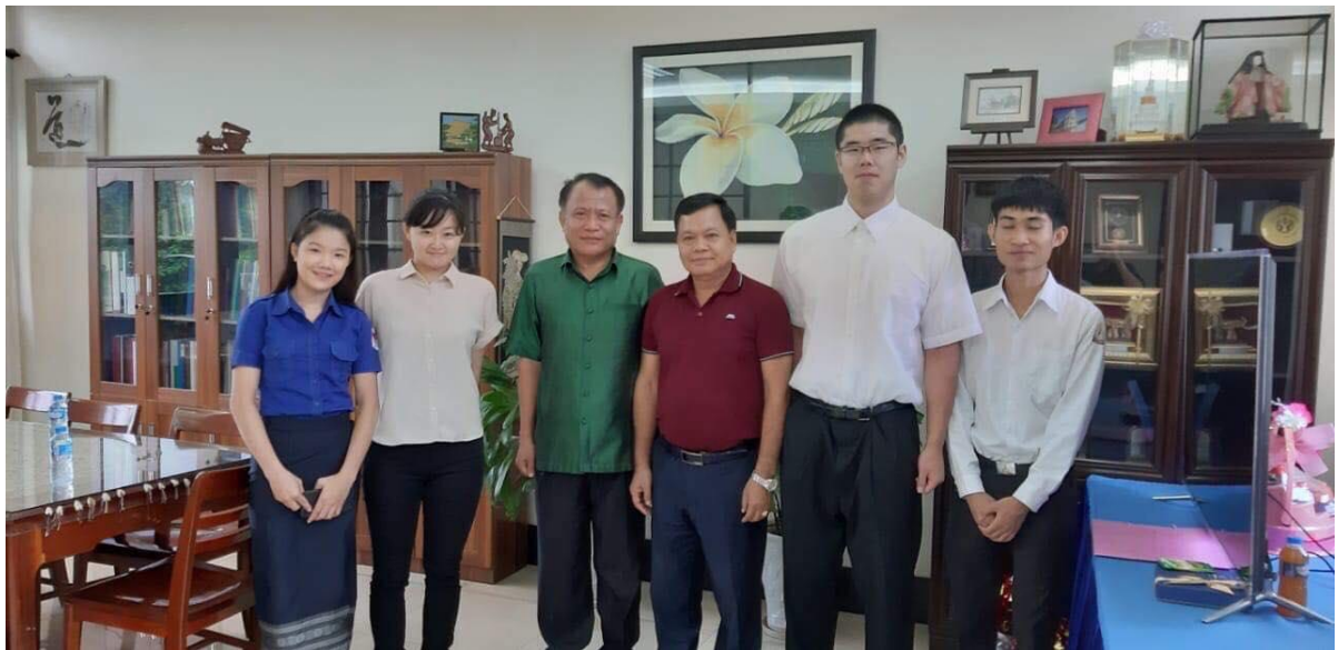
Visited Dean of Faculty of Engineering