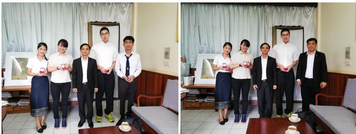
Visit vice president of National University of Laos in the morning