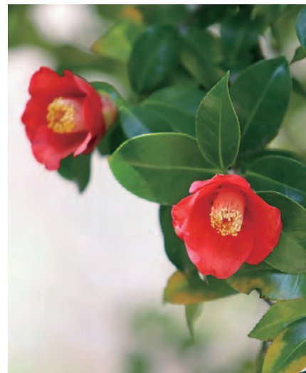
Camellia rusticana: Prefectural tree

The university actively promotes independent