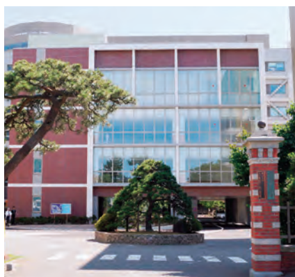
The front gate of Faculty of Medicine on Asahimachi campus