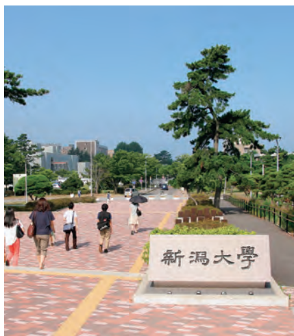
The main gate of Ikarashi campus

and creative studies for our students while also striving to be an international base for higher education and advanced research by promoting collaborative research and education with overseas universities and institutions. Located in Niigata City, facing the Sea of Japan, Niigata University acts as a gateway to the world with its base in Asia, and we will continue to elevate our presence to be world-leading and world-changing.