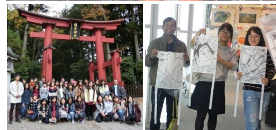
One day study trip