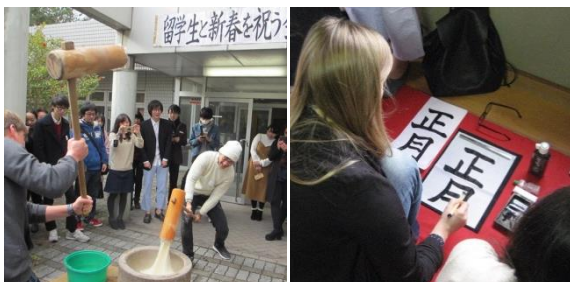
Rice-cake making event