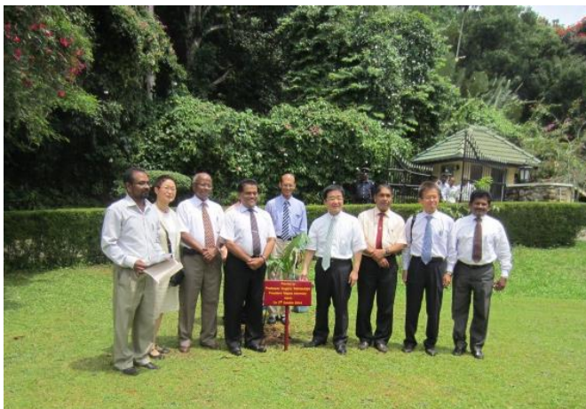
The Takahashi tree in 2014