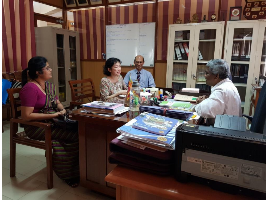
Meeting with collaborators of the research project at Niigata and Peradeniya