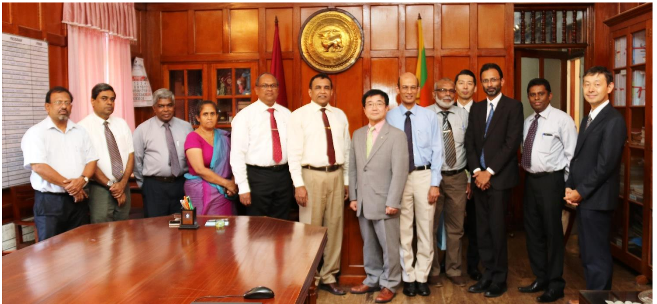
Photo taken at Vice Chancellors office, UoP