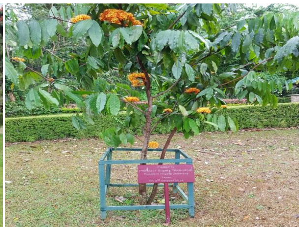
The Takahashi tree in March 2018