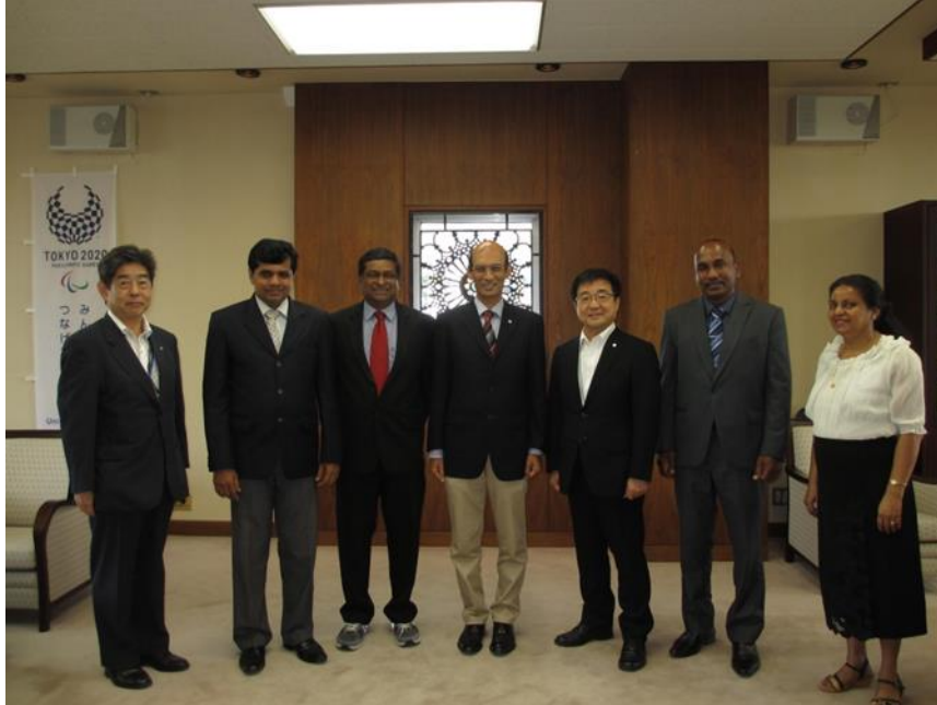
Staff training program 2017 At Presidents office.

The staff training program which commenced in 2011 is functioning well and it will be for the 8 th time that 3 officials from the UoP will be attending the program this year. As a recognition to the Faculty of Dental Sciences which commenced the Sister Link program an official from the FDS was selected last year.