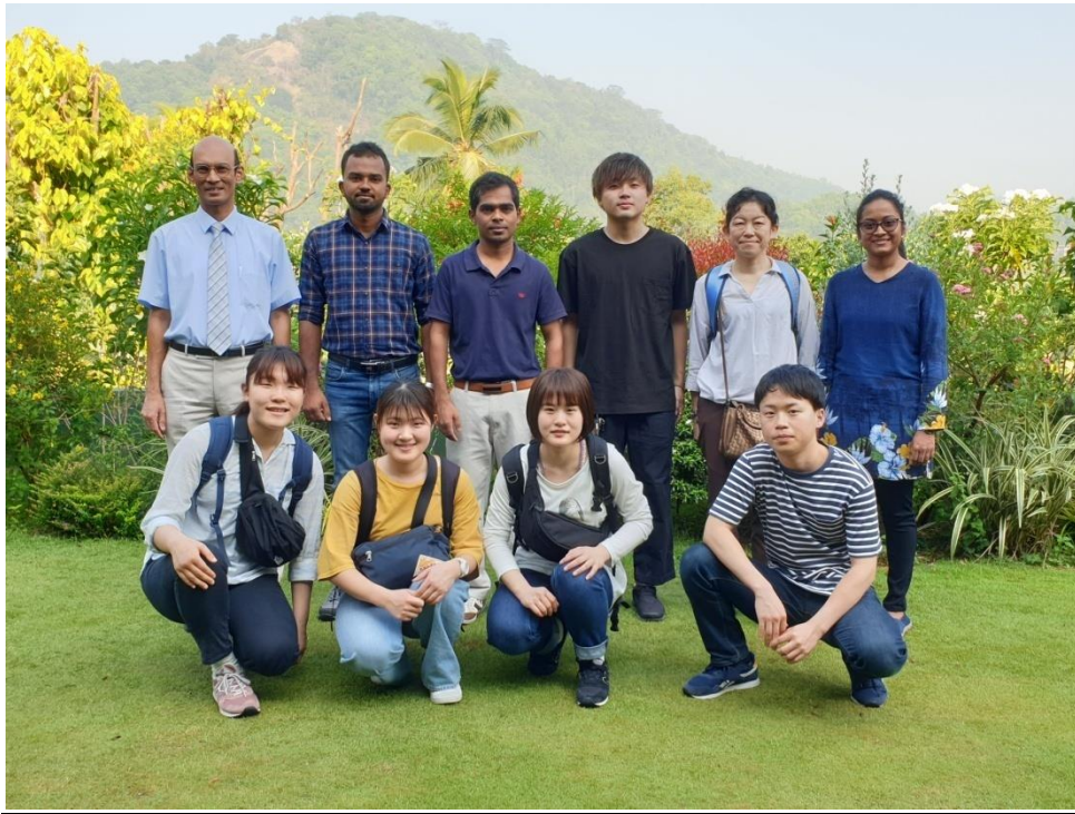
At the hotel