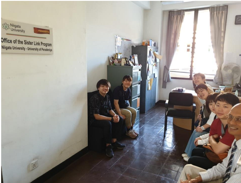
Agriculture Students and staff at the Sister link office 2019

Coordination of all Sister Link related activities are performed from the office. As such visiting students and staff from NU have access to the office.