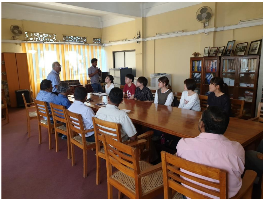
Meeting with Dean and staff of at the Faculty of Agriculture, University of Peradeniya.