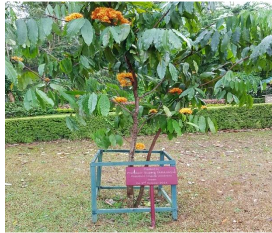
The Takahashi tree in March 2018