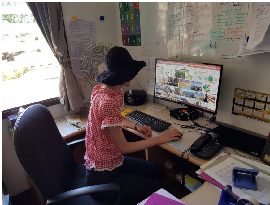
The student from the Faculty of Agriculture, NU preparing for her presentation at the Sister link office 2018