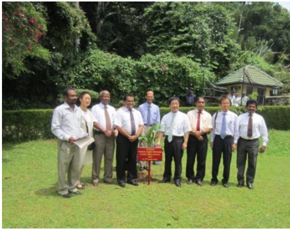
The Takahashi tree in 2014

The Takahashi tree which is planted in the lawn of the Vice Chancellors official residence “The Lodge”