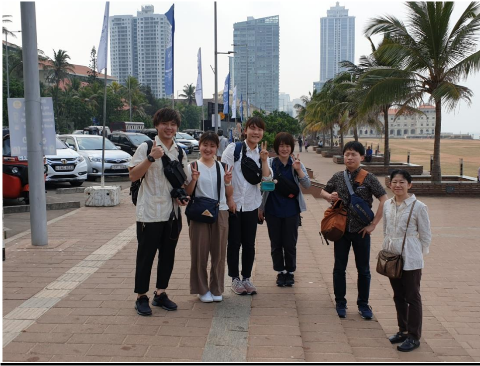
Sightseeing in Colombo