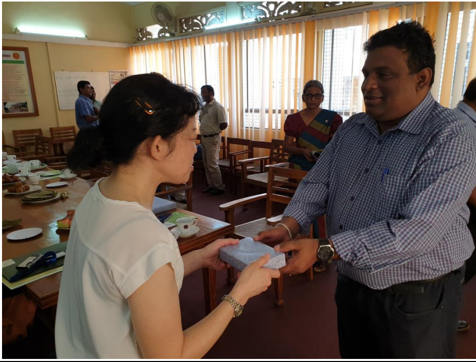
At the Niigata-Peradeniya sister link office