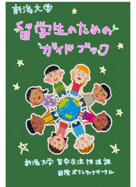
Guidebook for International Students

Please refer to Guidebook for International Students * or the Campus Maps ( Ikarashi and Asahimachi ).