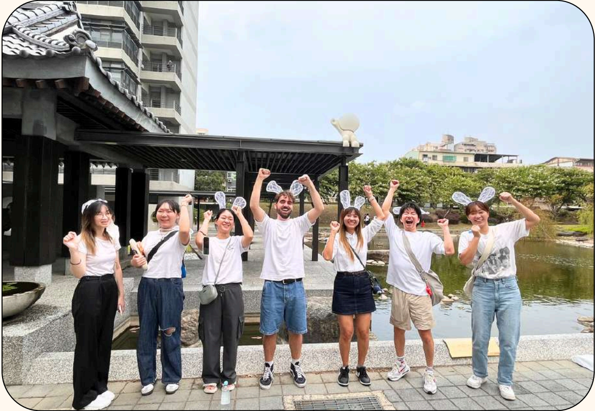
CHINESE LANGUAGE CENTER

The center was established in 1975. Initially, it taught Chinese to overseas Chinese children. Due to its excellent educational performance and convenient transportation, it expanded its enrollment to general foreigners and provided professional courses and an excellent Chinese language learning environment.