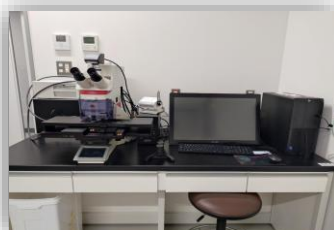
2nd Floor, Joint Research Building (School of Medicine)

Used for omics analysis, single-cell recovery, and micro-area analysis of tissues, including pathological and fluorescently labeled samples.