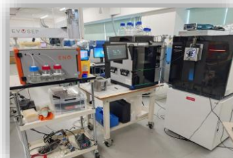
3rd Floor, Joint Research Building (School of Medicine)

Supports high-depth, high-throughput proteomic analysis, including ultra-low-amount samples.