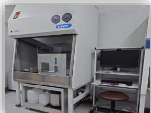
2nd Floor, Joint Research Building (School of Medicine)

Enables high-throughput isolation of specific cell populations for improved downstream analysis. Applicable to gene editing, stem cell biology, immunology, and genomics, and supports P1/BSL1 and P2/BSL2 levels.